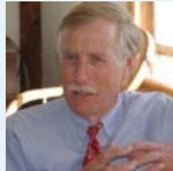
The Honorable Angus King Former Governor of The State of Maine