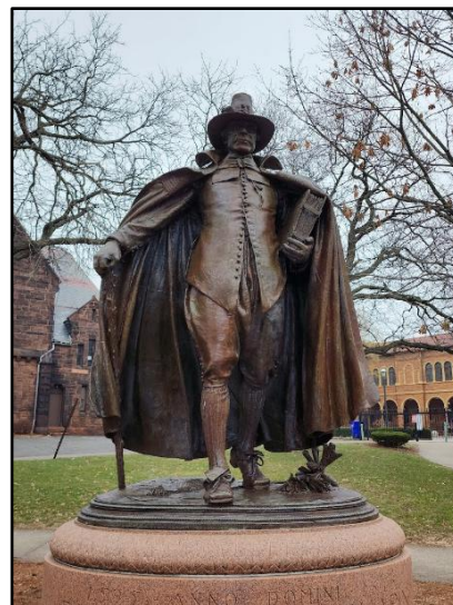
Fig. 1 Augustus Saint-Gaudens, The Puritan , 1886, bronze, Merrick Park, Springfield, Massachusetts.

The staggering toll of the Civil War burdened Americans long after General Lee's surrender at Appomattox Courthouse in the Spring of 1865. Reflecting on Milton and the aftermath of England's own civil war, T.S. Eliot questioned "whether any serious civil war ever does end," 1 lamenting that the effects of a convulsed England were still felt even then in 1960, long after the Restoration of Charles II. Following the defeat of the Confederacy, a similarly morbid convulsion tore at the fabric of a grim-visaged Union. Despite the dismal failures of the Reconstruction period, the United States miraculously emerged into the Gilded Age of the late 19 th century as a consolidated and industrializing nation in search of moral order 2 . The concept of a collapse of meaning bodes well with the theories of French psychoanalyst Jacques Lacan, whose dense but illuminating theories enable a better understanding of Augustus Saint-Gaudens' seminal work, The Puritan (1886) (fig. 1). This forlorn monument plays a fascinating role in a postbellum cultural landscape stained by the violent racial order of the South, the challenges of urban modernity in the North, and the final devastation of the Native Americans west of the Mississippi.