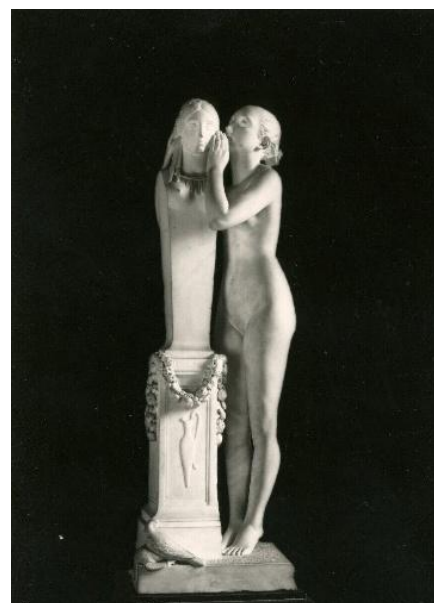
Fig. 2 Francois Jouffroy, The Secret of Venus , 1839, marble, Louvre Museum, Paris.