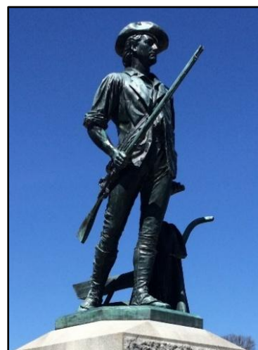
Fig. 5 Daniel Chester French, The Minute Man , 1874, bronze, Minute Man National Historical Park, Concord, Massachusetts.

Consider, as a comparison, Daniel Chester French’s Minute Man (1874) (fig. 5), which constructs a similar Borromean Knot. Unlike the ironic ambiguity of The Puritan , French’s Minute Man signifies a true moral clarity and a patriotic resolve born of its ardent movement forward, its upturned gaze, and its everyman temperament that embodies hope and resilience. Its Symbolic order is held together sincerely and contains the Real. It performs and inhabits the Name-of-the-Father perfectly, bestowing on its viewer a restrained sense of duty and civic virtue. This young farmer stepping away from his plow to pick up his musket references the violence of the American Revolution, certainly, but this abject violence remains well-sutured into the chain of signifiers that operate alongside the Imaginary and the Real to create the Subject and orbit desire. The Puritan , caricatural in its symbolism, attempts to signify law, order, and paternal authority, but does so with a theatrical excess that compromises its integrity. More King Lear than Moses,